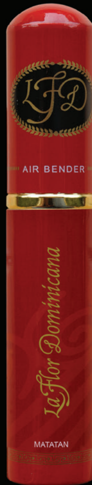
Air Bender Matatan 50 x 5