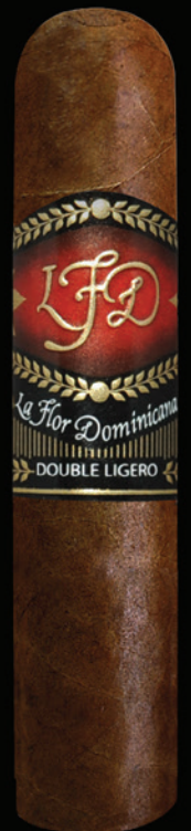
DL 452 52 x 4