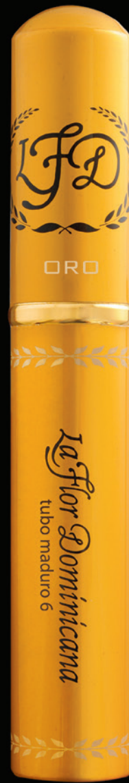
Tubo No. 6 Maduro 54 x 6