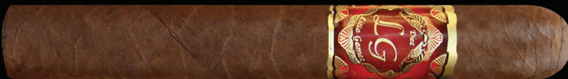
Galego - 60 x 6 1/4