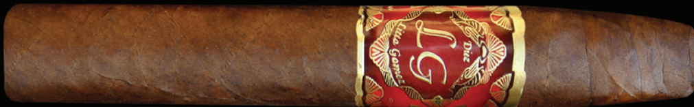
Chisel® Puro - 54 x 5 1/2