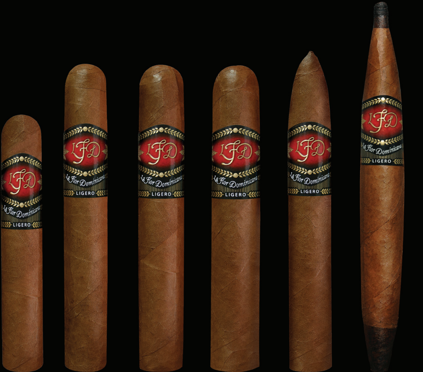
L 250 48 x 4 3/4