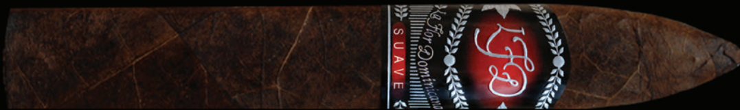
Grand Maduro 6 - 54 x 5 3/4