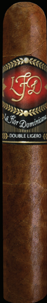
DL 600 52 x 5 1/4