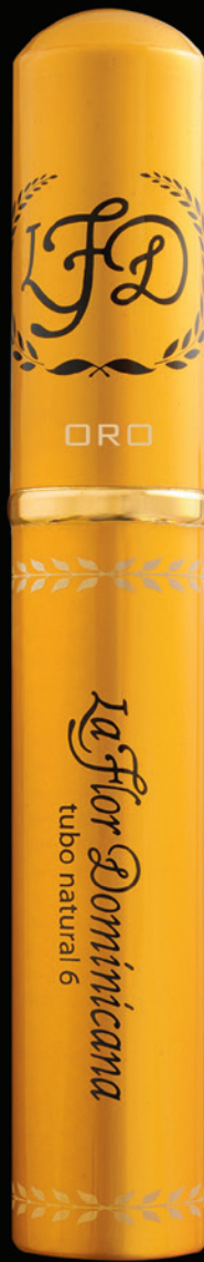
Tubo No. 6 Natural 54 x 6