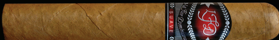
Maximo - 54 x 6