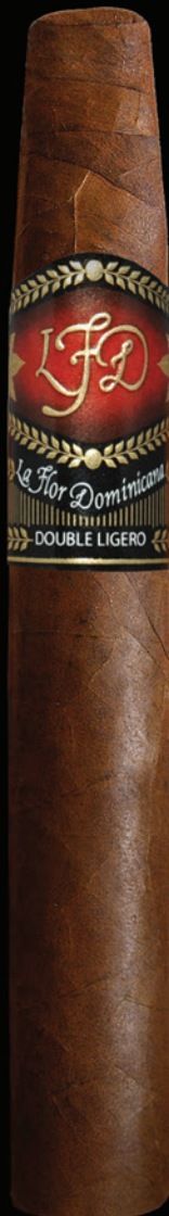
Chisel® 54 x 6