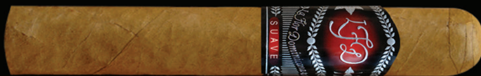
Maceo - 48 x 5