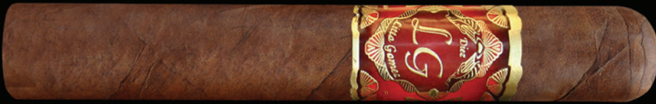
Cubano - 50 x 5