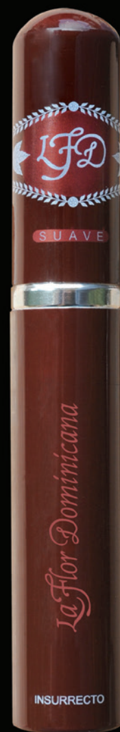
Suave Insurrecto 42 x 5 1/2