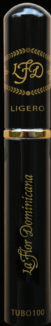
Ligero 100 42 x 5 1/2