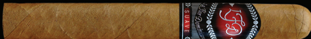
Insurrecto - 42 x 5 1/2