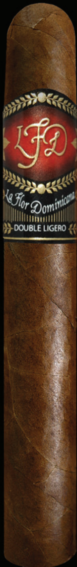
DL 654 54 x 6