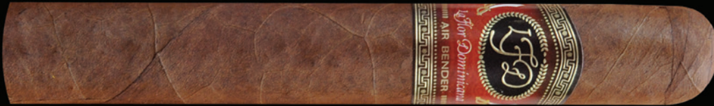
Maestro - 52 x 5 1/2