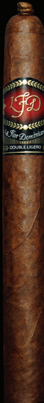
Especiales 48 x 6 7/8