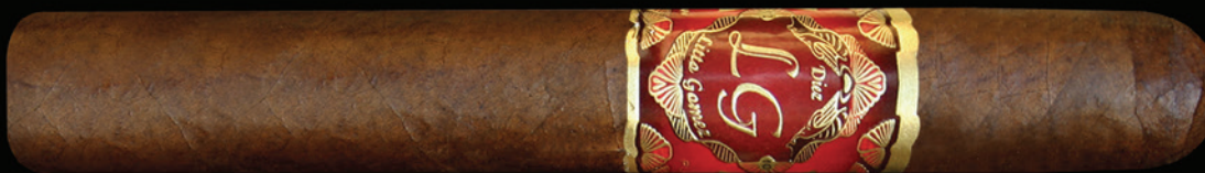
Lusitano - 52 x 6