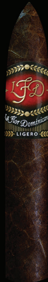
Torpedito 50 x 4 3/4