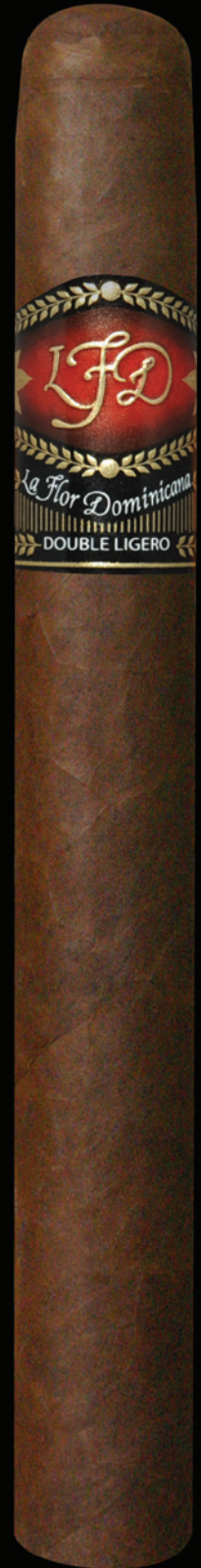
Digger 60 X 8 1/2