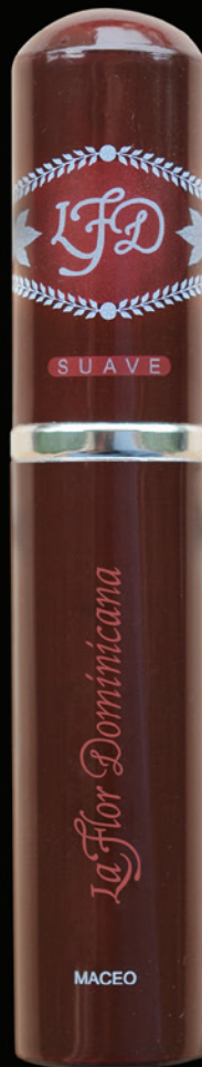
Suave Maceo 48 x 5