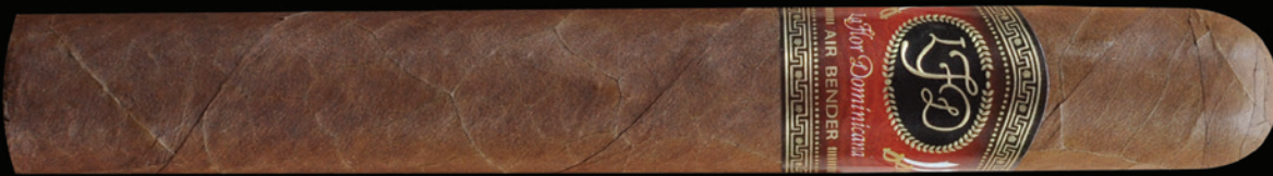
Guerrero - 54 x 6 1/4