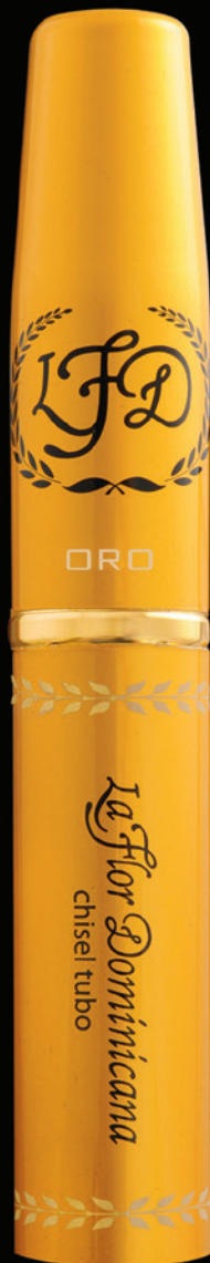
Chisel® Tubo 54 x 6