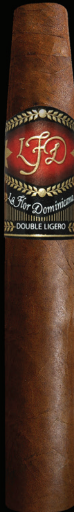
Chisel® Gorda 48 x 5 1/2