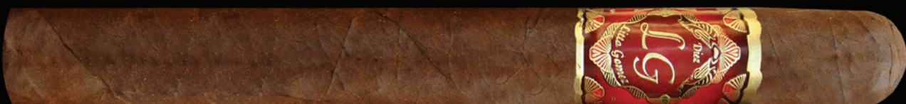
Dominicano - 50 x 6 7/8