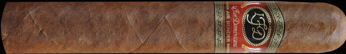
Valiente - 60 x 6 1/4