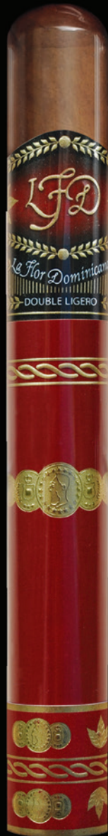
DL Corona Tubo 44 x 5 5/8