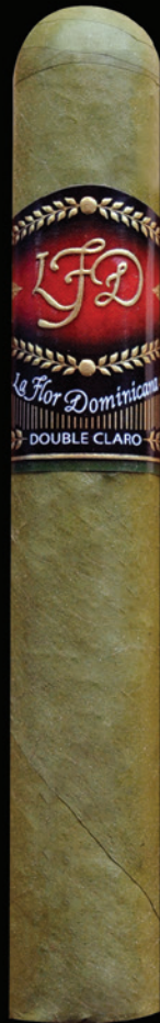
Double Claro 50 50 x 5