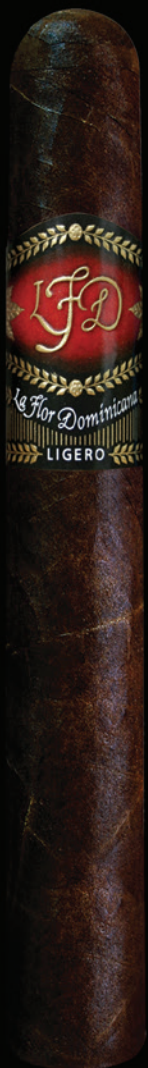
L 300 Cabinet 50 x 5 3/4