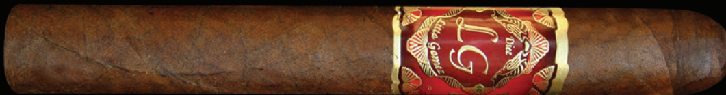
Americano - 46 x 5 3/4