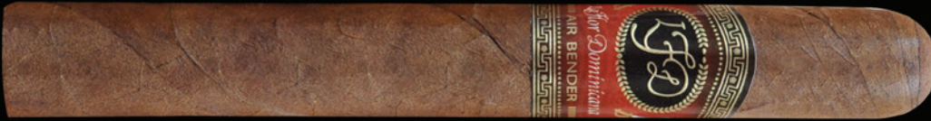
Poderoso - 44 x 5 1/2