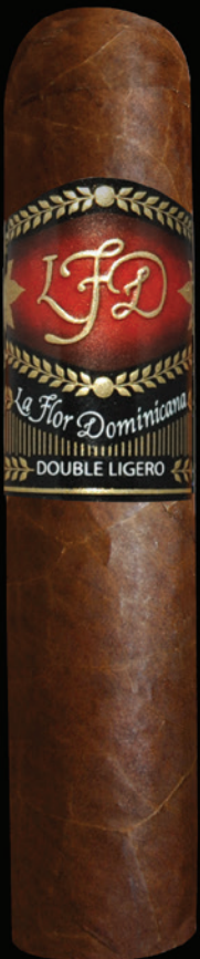
DL 660 60 x 4 5/8