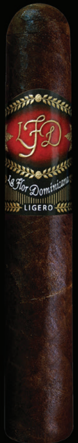
L 250 Cabinet 48 x 4 3/4