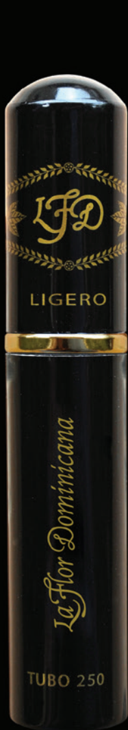
Ligero 250 48 x 4 3/4