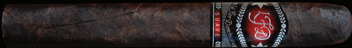
Grand Maduro 5 - 52 x 6 1/4