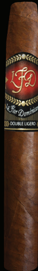
Chiselito® 44 x 5