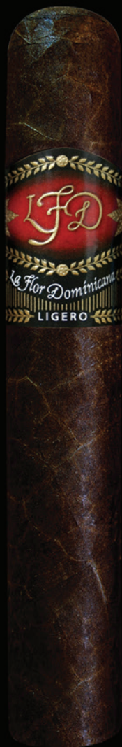
L 500 Cabinet 60 X 5 3/4