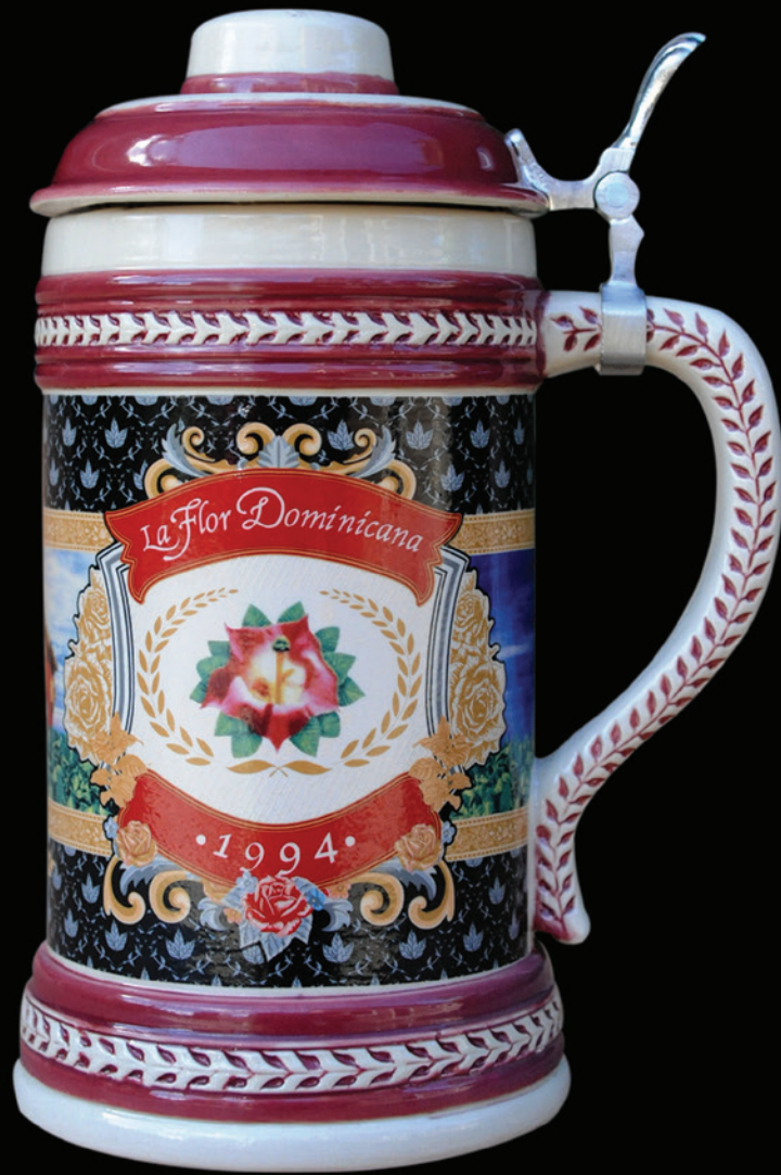
20 CIGARS - 54 X 6 LIMITED EDITION BEER STEIN