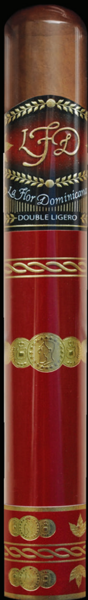
DL Robusto Tubo 52 x 5 3/4