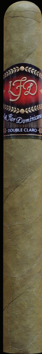
Double Claro 48 48 x 6 7/8