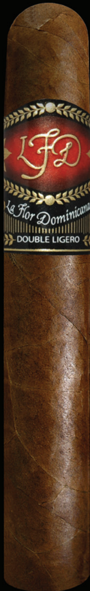
DL 700 60 x 6 1/2