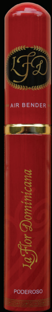
Air Bender Poderoso 44 x 5 1/2