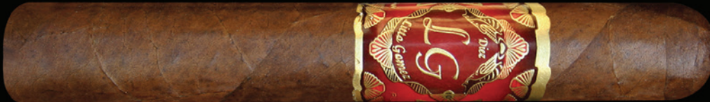
Paisano - 52 x 5 1/2