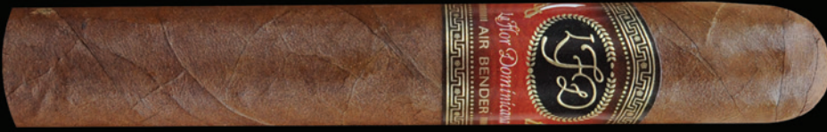
Matatan - 50 x 5