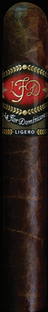
L 400 Cabinet 54 x 5 3/4